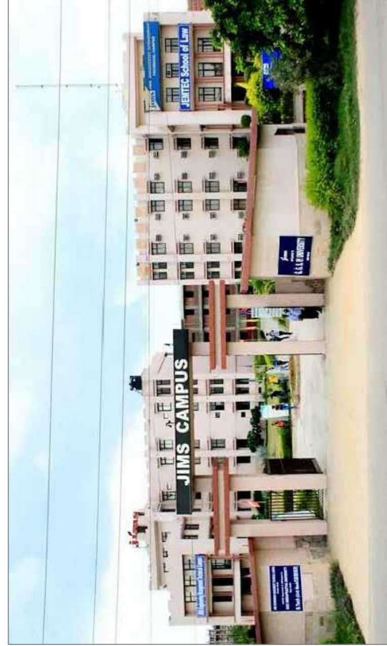
JIMS ENGINEERING MANAGEMENT TECHNICAL