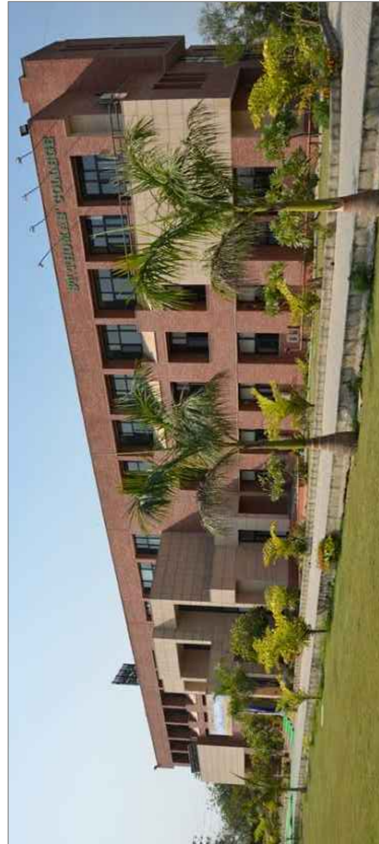
ST. THOMAS COLLEGE OF EDUCATION